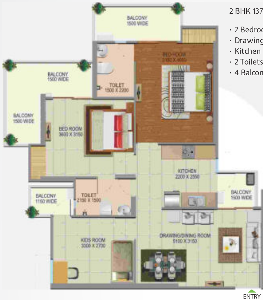
2 BHK 1375 Sq. Ft.